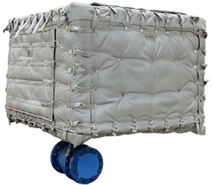
8" (DN200) ESD with fire proof jacket

These distinctive ESD systems are another solution from Microfinish valves and our desire to enhance the reliability and safety in the refining industry.